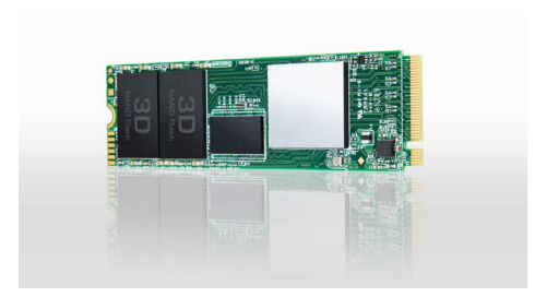
PCIe Gen3 x4 interface and NVMe standard

Transcend's MTE850 M.2 SSD utilizes the PCI Express® Gen3 x4 interface supported by the latest NVMe™ standard, to unleash next-generation performance. The MTE850 M.2 SSD aims at high-end applications, such as digital audio/video production, gaming, and enterprise use, which require constant processing heavy workloads with no system lags or slowdowns of any kind. Powered by 3D MLC NAND flash memory, the MTE850 M.2 SSD gives you not only fast transfer speeds but unmatched reliability.